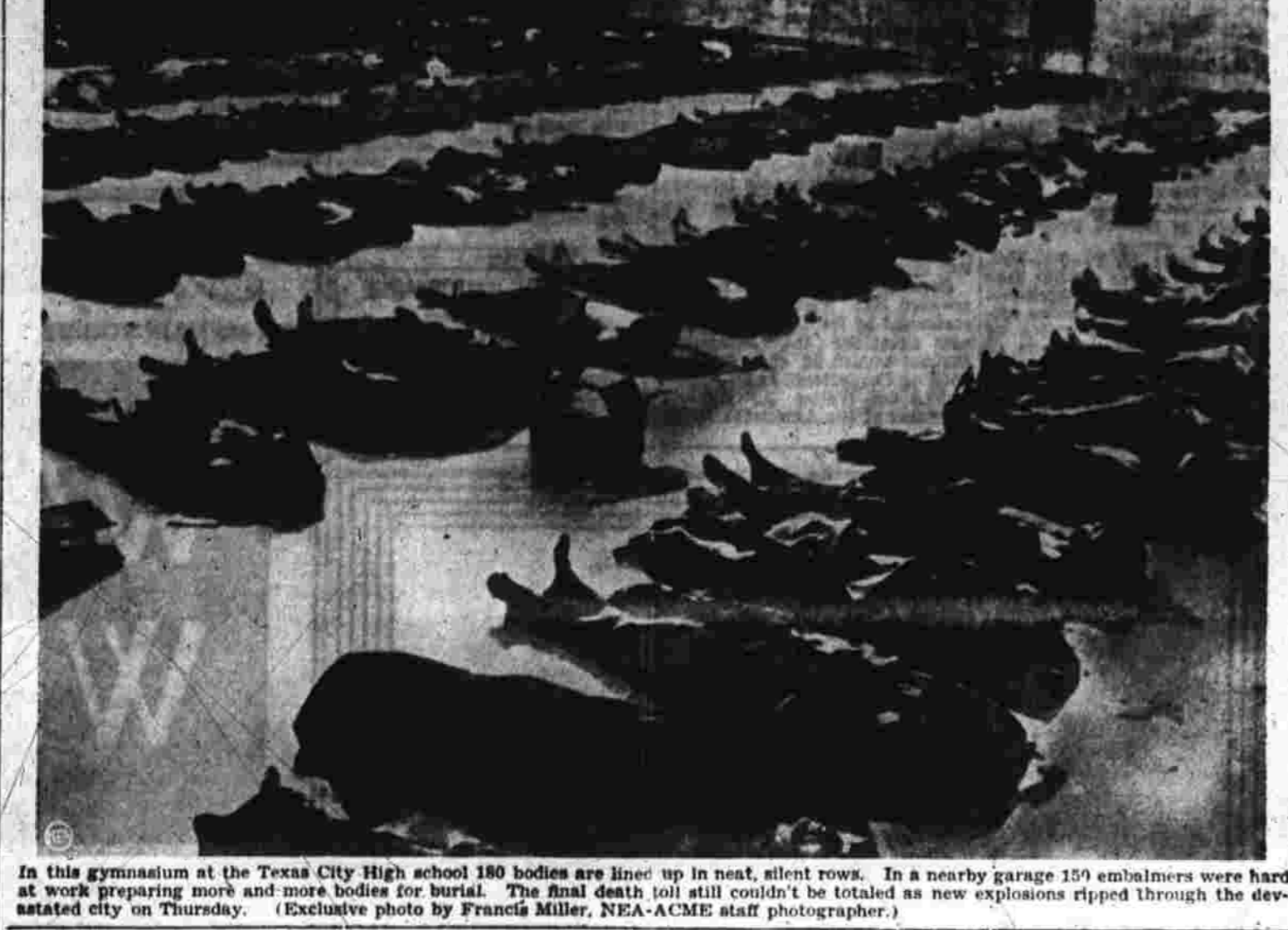
In this gymnasium at the Texas City High school 180 bodies are lined up in neat, silent rows. In a nearby garage 150 embalmers were hard at work preparing more and more bodies for burial.